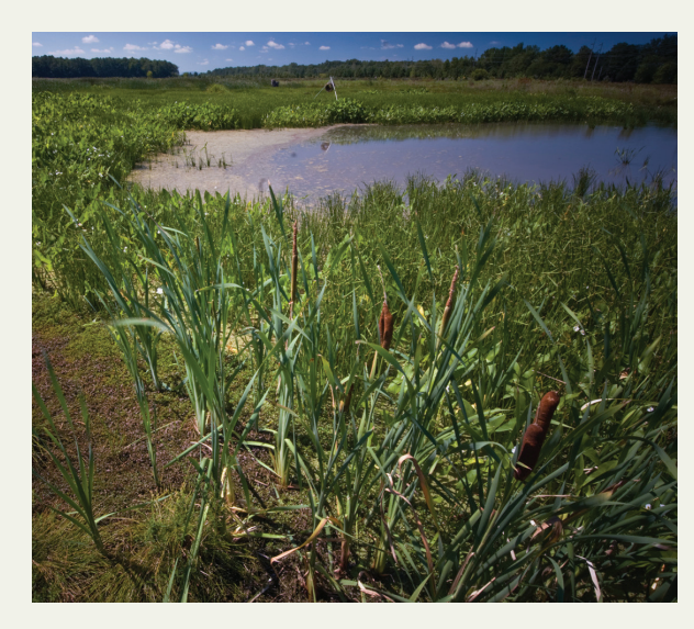
Restoring wetlands can help provide vital habitat for black duck and many other species.