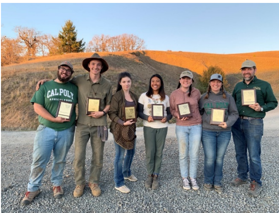
Cal Poly–San Luis Obispo team won individual awards, group judging, and overall team award.