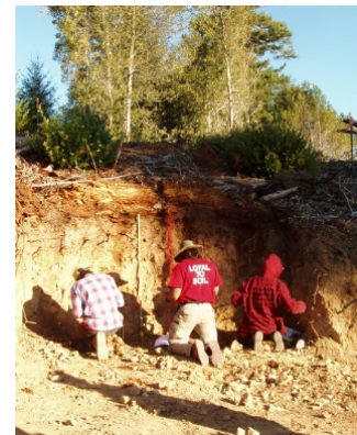
Chico State team at site #2 in beautiful Humboldt County.

To successfully describe a soil pit, contestants must fill out their score-cards with the correct site characteristics; physical characteristics of each identified soil horizon, including soil texture, color, and structure; soil taxonomy; and selected site interpretations of the soil.