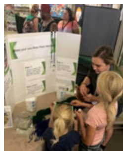
Hands-on exhibits and activities.