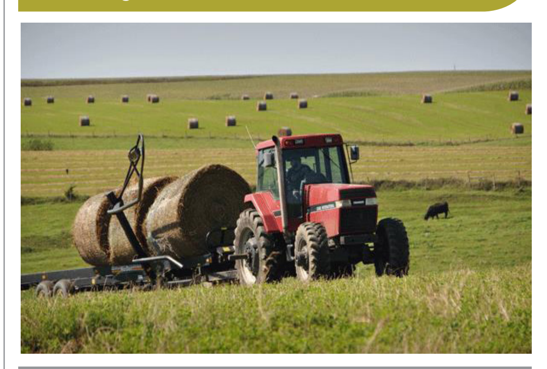
USDA's Natural Resources Conservation Service offers voluntary Farm Bill

Environmental Quality Incentives Program Organic Initiative